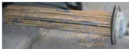
With AquaKat : 6 month after installation