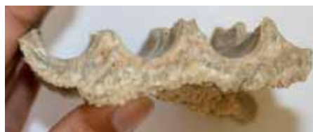
Without AquaKat : 1 cm lime had to be taken away after 8 month.

back to normal. It is therefore recommended to flush closed systems from time to time in order to remove the substances that were dissolved from the system by the AquaKat. Only then could an expensive and elaborate crystallisation analysis illustrate which changes, even towards spring water-like structures, the AquaKat has caused. Clear evidence for the improvement of relevant values can be seen in the test carried out by the French Navy. The measurement records also show that temporary re-dissolving occurred in the pipe system, which explains occasional anomalies in the measurements. As soon as the pipes went back to a "clean" state, the general tendency remains that of improved water.