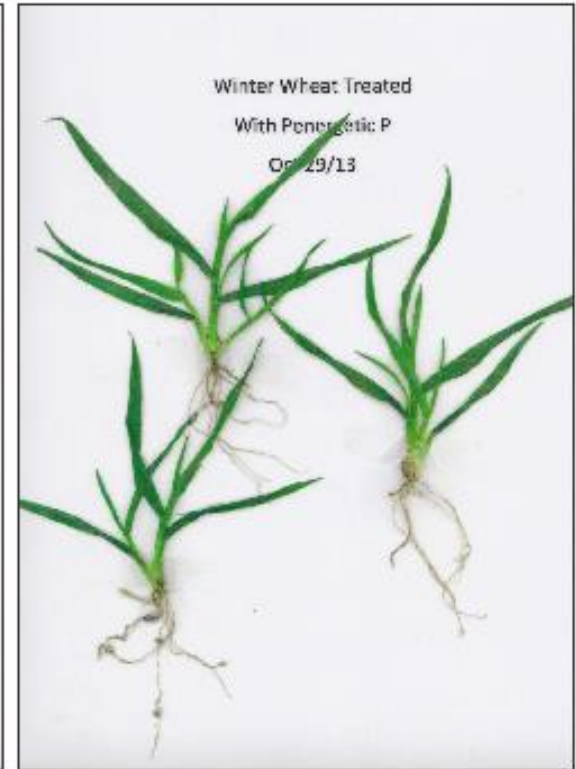
Treated with Penergetic p