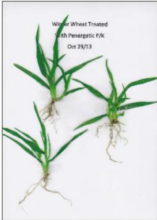
Treated with Penergetic p and k